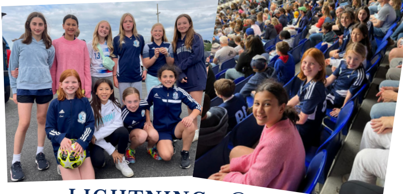
LIGHTNING: @ Gotham FC match!