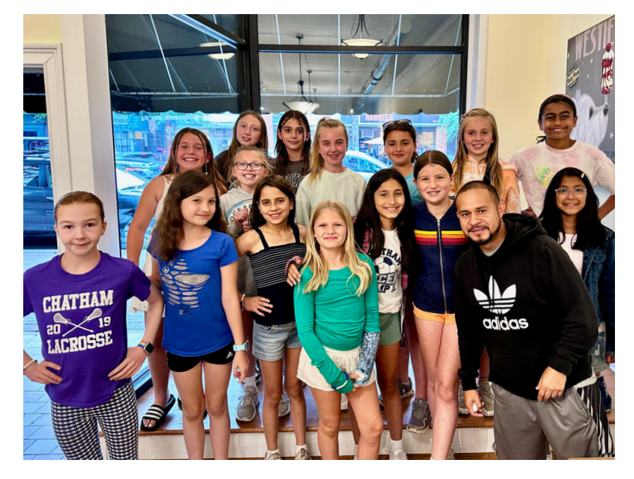
TOROS: Celebrating a fun season!