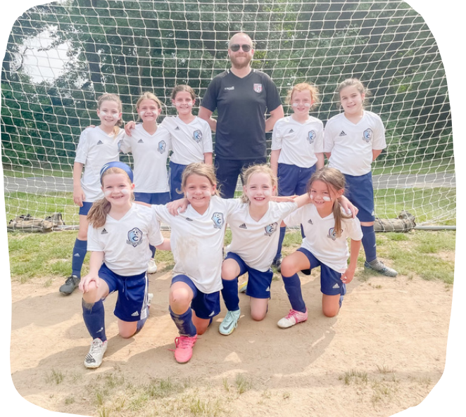
COMETS: Closing out the season strong!