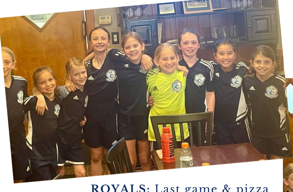
ROYALS: Last game & pizza party schenanigans!