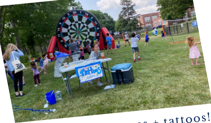
Soccer darts + games + tattoos!