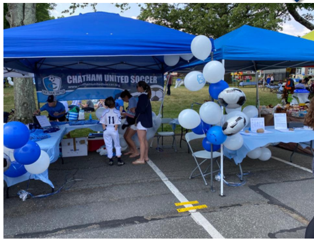
Booth volunteers made the day a success!