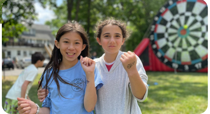
Chatham United Soccer