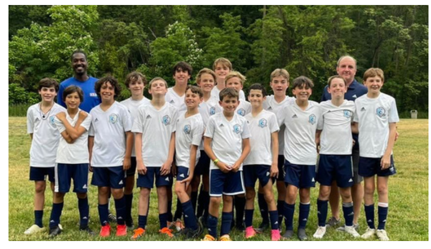
BRUINS: Finishing the season with a W!